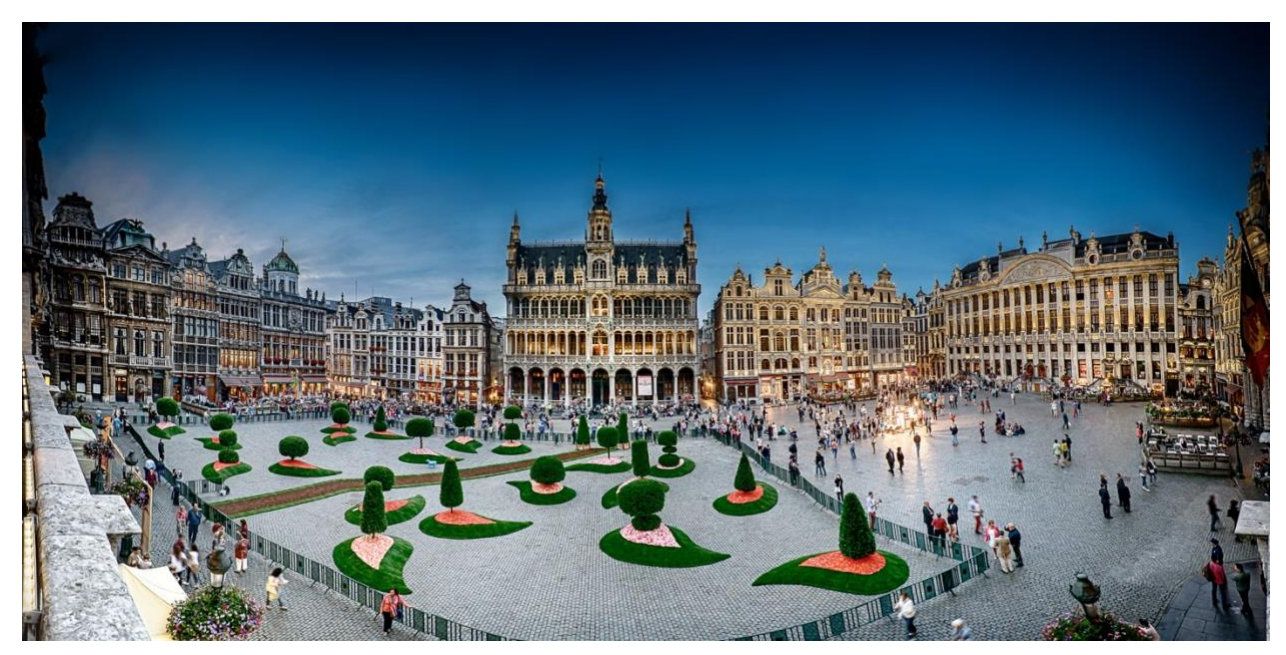
Grand Place – Flowertime 2013

As always, the flower-lined route begins in the Grand Place, "the most beautiful public square in the world". Your eye will instantly be drawn to the stunning floral arch, made from 500 fuchsia plants, that forms the entrance to the building. These superb plants come from De Nachtwaker, the nursery run by Geert Bonte , a former farmer whose passion for flowers and fuchsias led him to set up his own business in Moortsele.