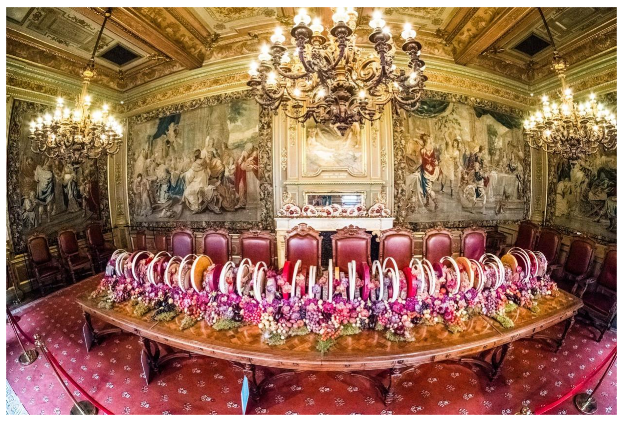
Maximilian Room - Flowertime 2017