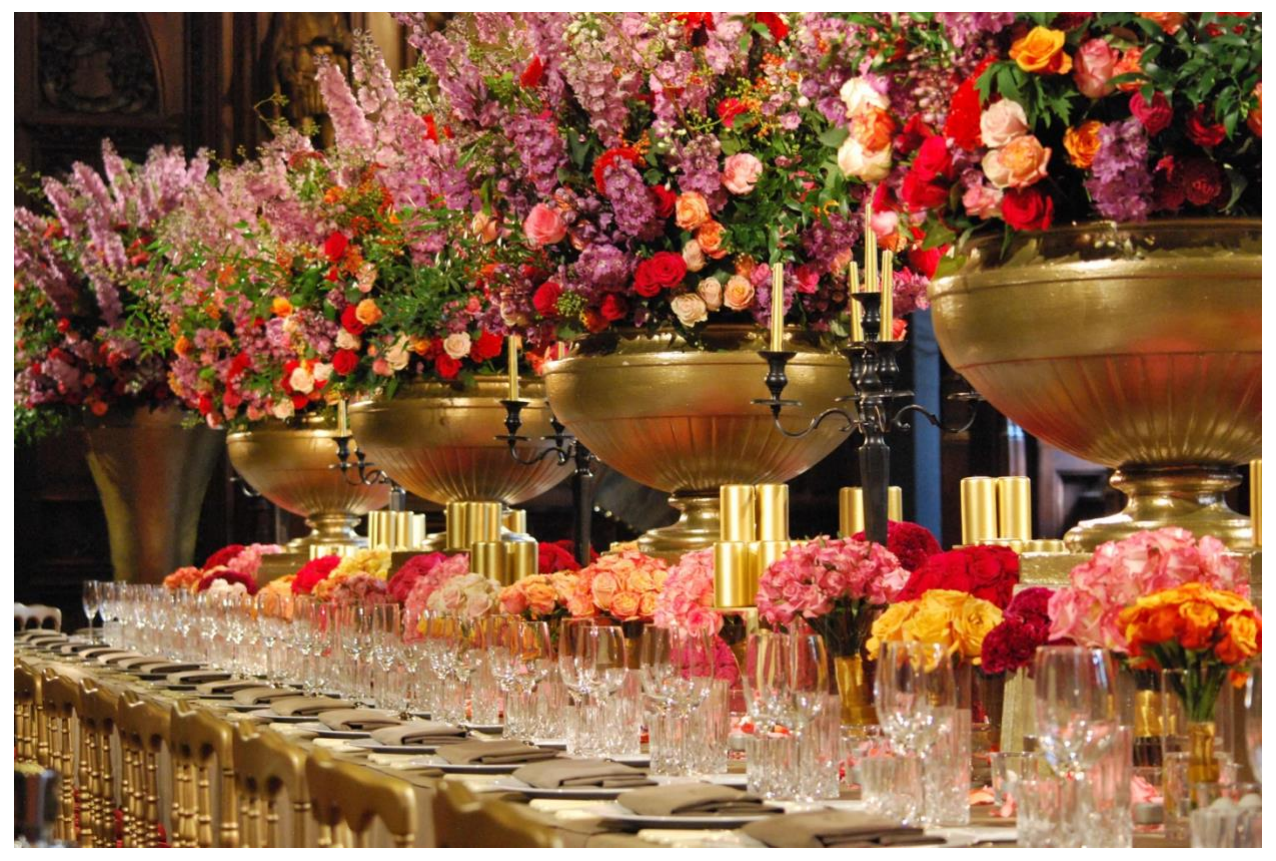
© Tom Paulussen – Gothic Room – Flowertime 2015